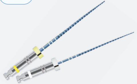
Safco RoyalFlex Files