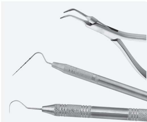
Safco Endo Instruments