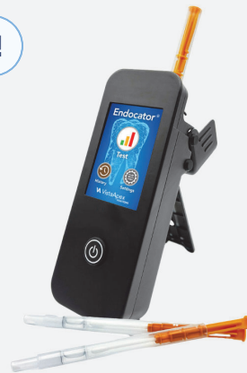
Vista Apex Endocator®